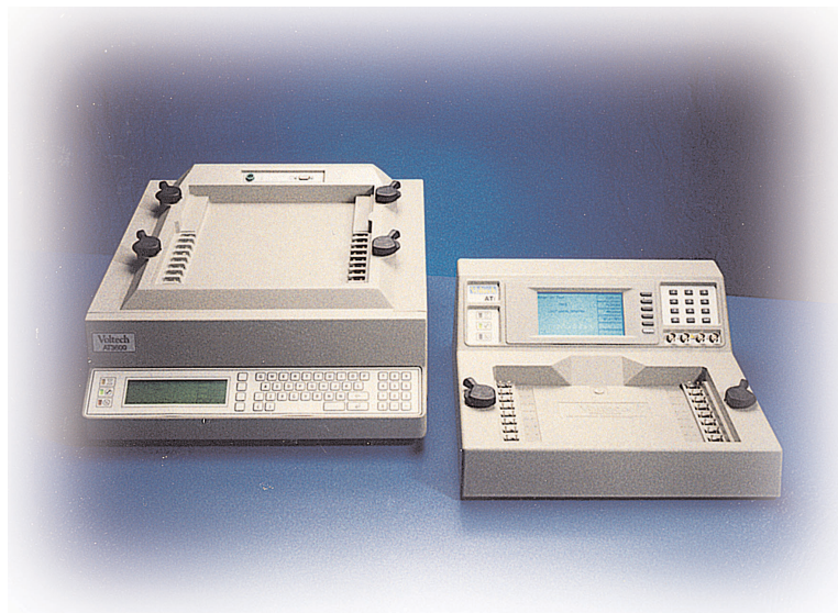
The Voltech AT3600 and ATi transformer testers

Should you have questions on any of the other test functions available for the Voltech AT series transformer testers, please do not hesitate to contact us.